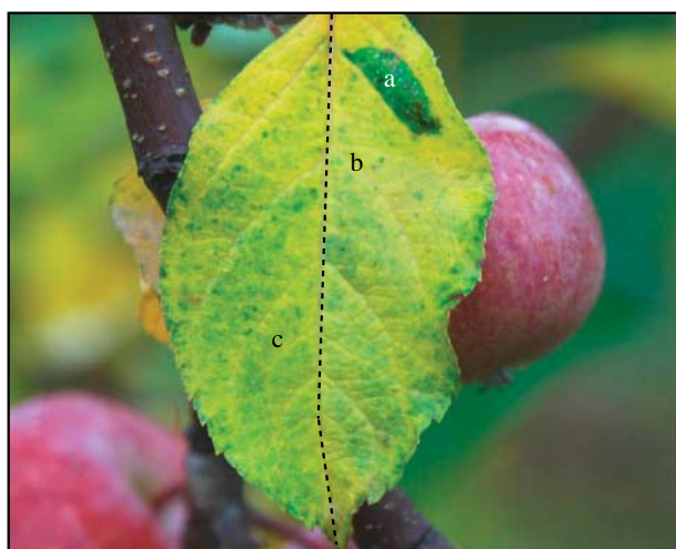
Figure 1. An apple tree leaf infected with the tentiform leafminer Phyllonorycter blancardella larva in autumn. The 'Green island' (feeding area) exhibits intact green chlorophyll-containing tissues, while the remaining leaf tissues undergo leaf senescence. The white spots on the mine are feeding windows, where all but the epidermis has been consumed by the caterpillar. Letters show areas used for cytokinin and nutrient content analysis: 'a' mined, 'b' ipsilateral and 'c' contralateral plant tissues.